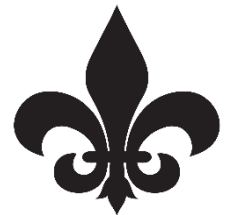
A modern gun showing nitro, superior and steel proof for 76mm (3 in) cartridge. The 'fleur de-lis' shows it is suitable for high performance steel cartridges.

e. What chokes have I got? Steel shot is less compressible than lead as it accelerates up the barrel and gets squeezed by the chokes. As a result, the high-performance steel cartridges have limits on what should be used. Shot sizes exceeding 4mm (BB and larger) should only be fired through a choke less than 0.5mm (half choke).